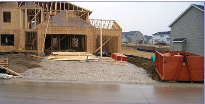
This rock entrance provides mud-free access for construction workers and building materials.

Special care should be given to street inlets, as they are a direct conduit to local waterways. Inlet protection should be the last line of defense for protecting local streams and surface water.